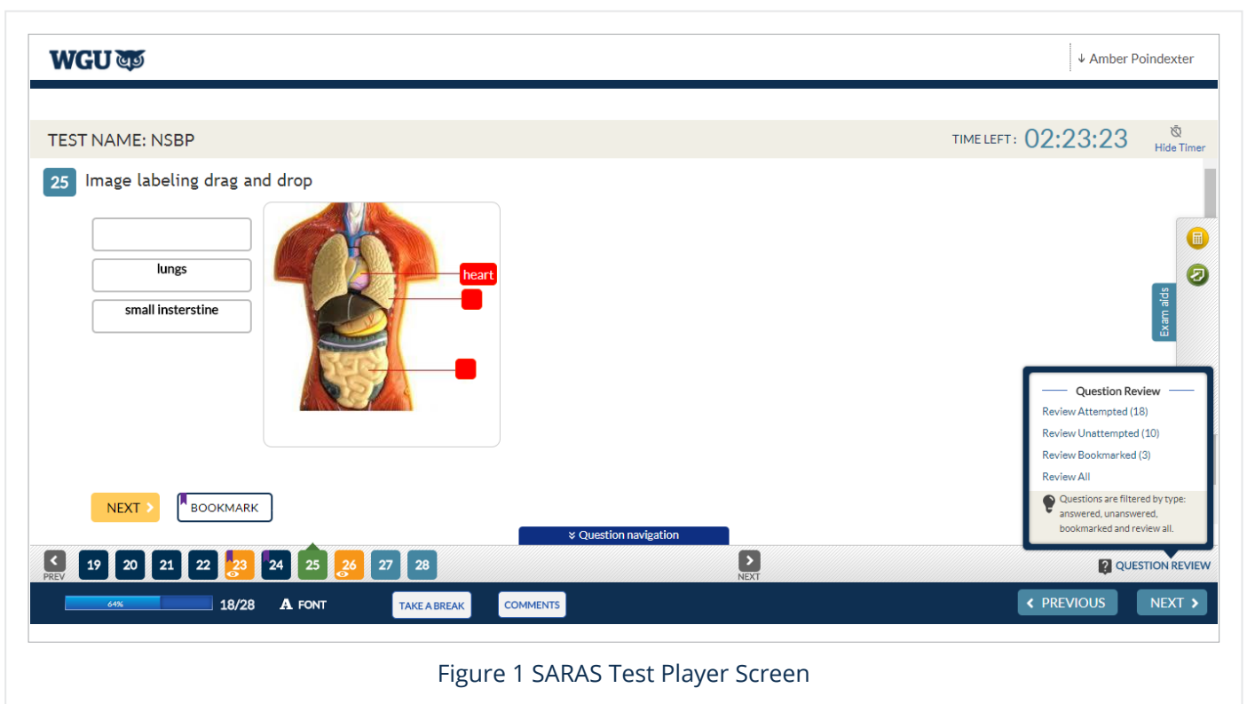
Figure 1 SARAS Test Player Screen

SARAS exam monitoring interface allowed proctors to monitor students' activities and check for any signs attempts of malpractice/cheating during High stake tests online. Proctors could manage multiple test sessions simultaneously, pause, resume or suspend a session as per their discretion.